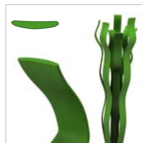
Fibre thickness: approx. 200 µm