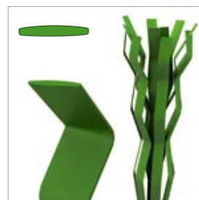
Fibre thickness: approx. 160 µm